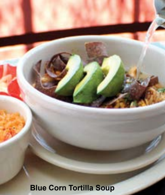
Blue Corn Tortilla Soup