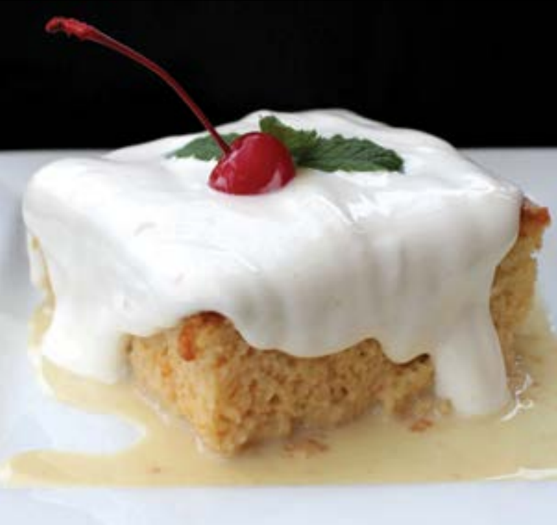
Homemade Tres Leches Cake