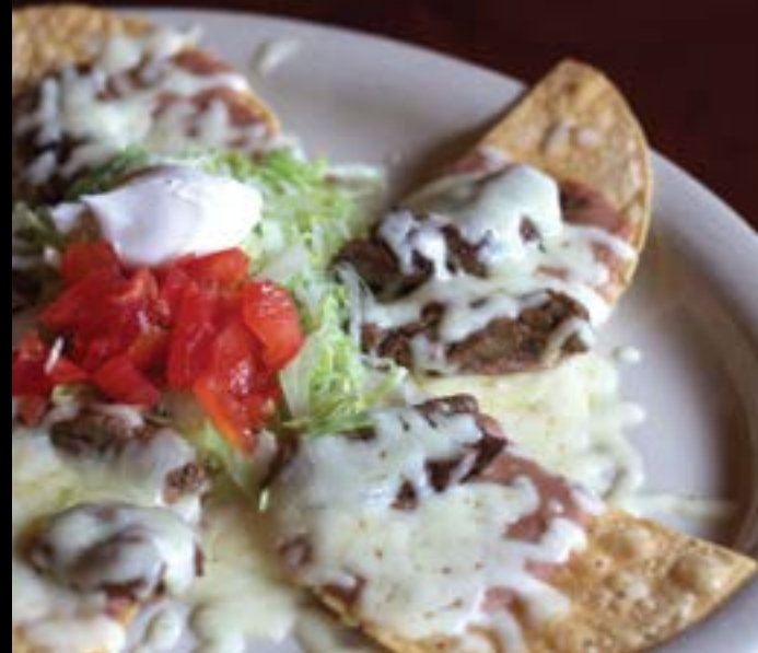
Nachos Al Carbon