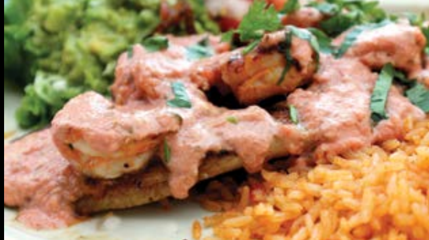
Swai Fish Oscar

One tostada with refried beans and your choice of ground beef or shredded chicken topped with lettuce, tomatoes, cheese, guacamole and sour cream.*